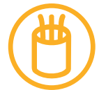
Selective Core Cable Identification