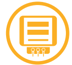
Highly Populated Control Panel Wiring